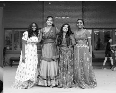
More cultural fair fun