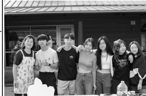
The South Korean table at the 2023 Cultural Fair