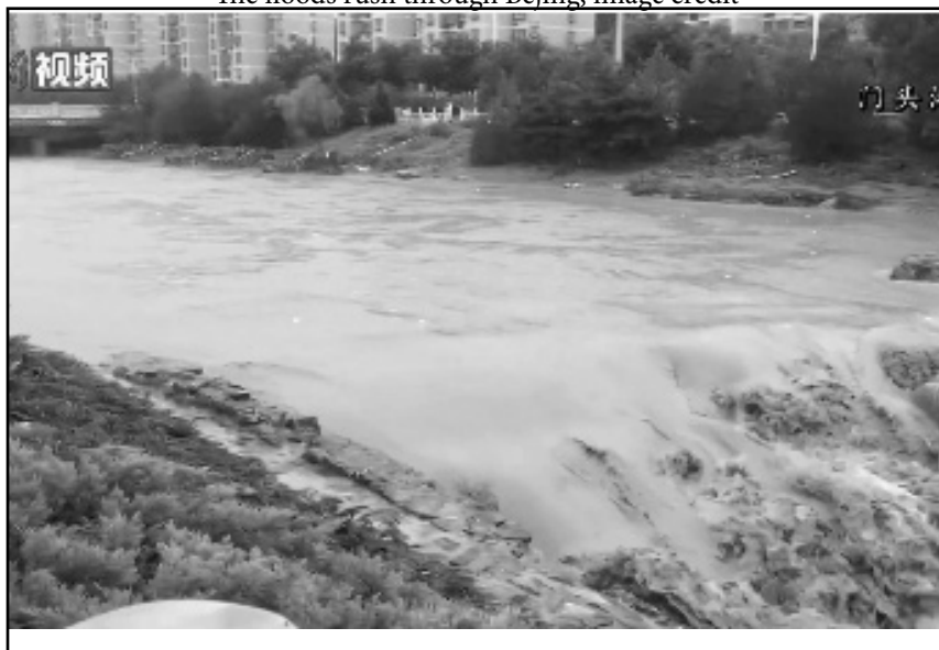
The floods rush through Beijing; image credit

According to officials, the government responded to the emergency immediately and effectively. Rescue teams relocated over 10,000 people in the first 2 days, with soldiers, construction workers and