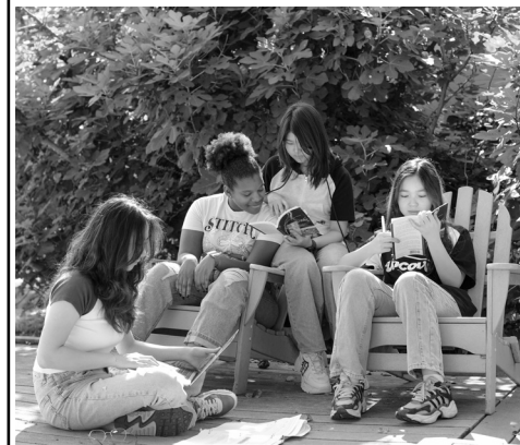
Studying on the lawn