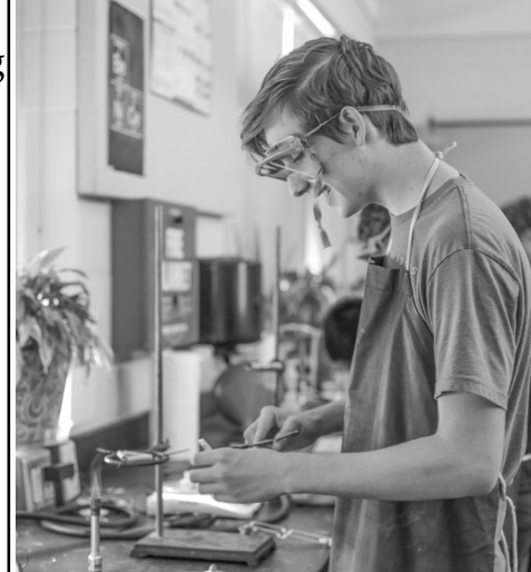
AP Chemistry Labs