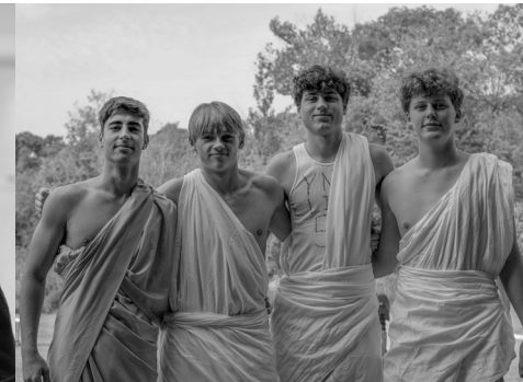
Spirit Week 2023- Toga Day