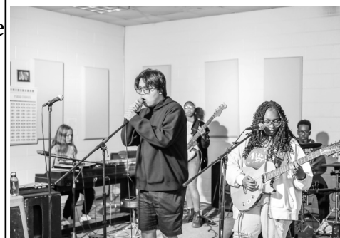
C-Block Contemp Breakout Performance