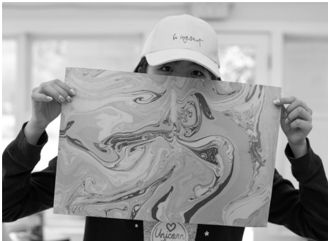
Paper marbling during Art Wednesday